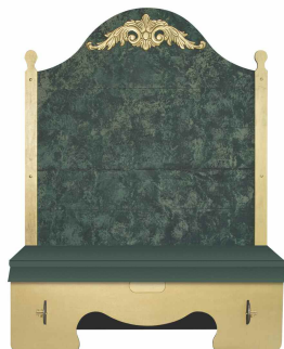
Celebration Gold Finish

Great for extended appearances such as corporate functions, school visits, retail events, and other multi-hour gigs. Save your legs and knees there's room for 3 to comfortably sit!