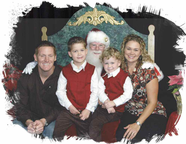
Room enough for the entire family.