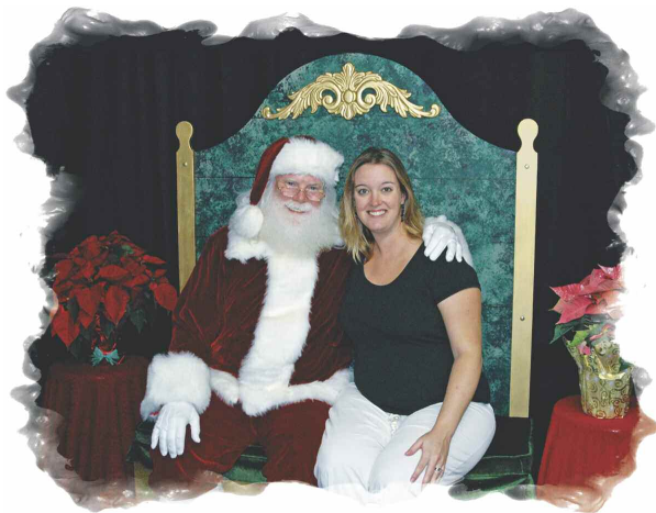
Even adults like to sit with Santa.